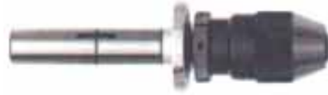
Pictured with optional drill chuck.