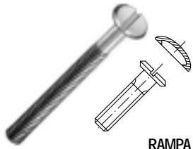
RAMPA Flathead Screws type FP